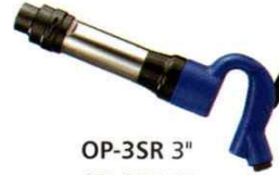
OP-3SR 3" OP-3SH 3"