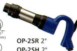
OP-2SR 2" OP-2SH 2"