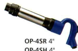
OP-4SR 4" OP-4SH 4"