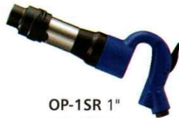
OP-1SR 1" OP-1SH 1"